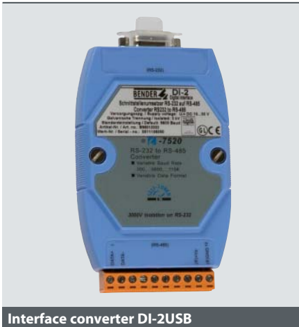
Interface converter DI-2USB